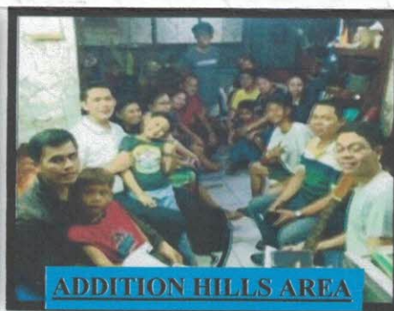
ADDITION HILLS AREA