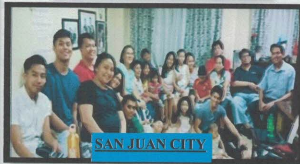
SAN JUAN CITY