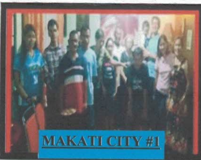
MAKATI CITY #1

At the moment, we have 6 other areas where the gospel is preached on a regular basis . We pray that in time, these outreaches will turn into local churches . Each area is led by preachers whom I personally trained.