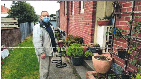
NZBBTP Class just before Lockdown