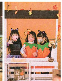
Family Fall Festival