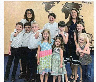
Patch & PeeWee Club