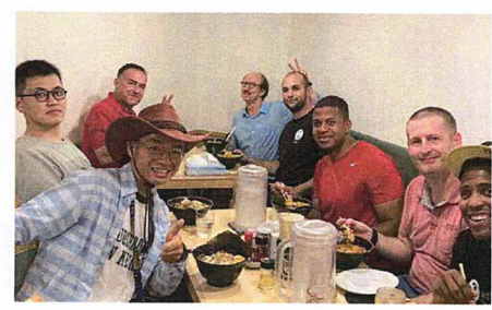
Ra-men's night out