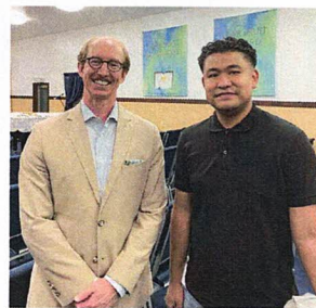
Taka got Baptized