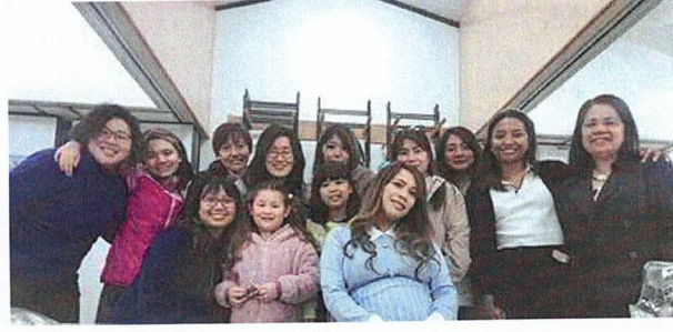
Baby shower for Precious