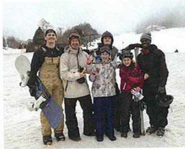
Ski with Airmen