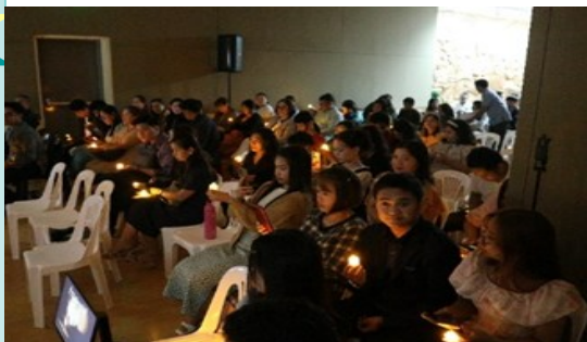
Congregation sinning, "Silent Night"