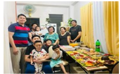
Our first Christmas without our father .