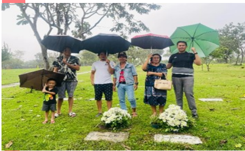
Visiting the grave of our father. He has served the Lord for 42 years.