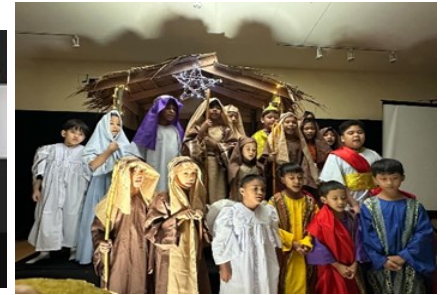
Kids narrate the Christmas Nativity