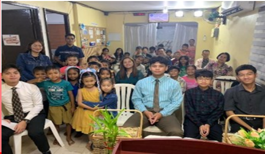
The mission work in Laguna Province

In October, we celebrated the 2nd Year anniversary of our youngest mission . This is the second church I've planted. It is in the province of Laguna, one hour south from Manila. We praise God because we have now regular attendees and weekly visitors in this area. Each Sunday, we have an average attendance of 35 to 40 . Meanwhile, our Bible school will end its second semester next month. I am teaching Homiletics class and praise God because 15 preachers will be able to finish their course soon .