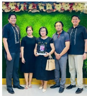
We continue his legacy