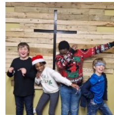
A few of the kids at TBF are showing off one of the new rooms

It's been five and a half years since we left Mallow in County Cork and moved our family to Tralee, County Kerry. We have established a growing ministry here through many challenges. We want to take a moment and say thank you to our church families that have been supporting us through it all both financially and prayerfully. There were many times that things felt so hard and heavy as we moved forward. We know we were sustained by your faithful prayers and lifting our family up and for that we are eternally grateful.