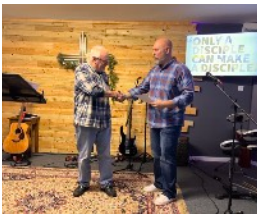
One-on-one discipleship is the heartbeat of the Ministry

And lastly, let's celebrate the incredible blessings from this past year! In 2024, we saw several individuals accept Christ as their Lord and Savior—what a joy! We witnessed lives transformed through believers' baptism, with many in our community witnessing these powerful commitments to Christ. We've welcomed new members into our church family, and others have begun exciting one-on-one discipleship journeys. One of the highlights for me this year is that five amazing individuals completed their one-on-one discipleship. Even though some have moved away, I'm thrilled that two of them are eager to begin new mentorships, and the best part? One of those five is now mentoring another person! My heart just overflows with joy to see this beautiful process of discipleship taking root in our church. Let's keep praying together that even more people will come to know the Lord, follow Him in baptism, and embark on their discipleship journeys this year!