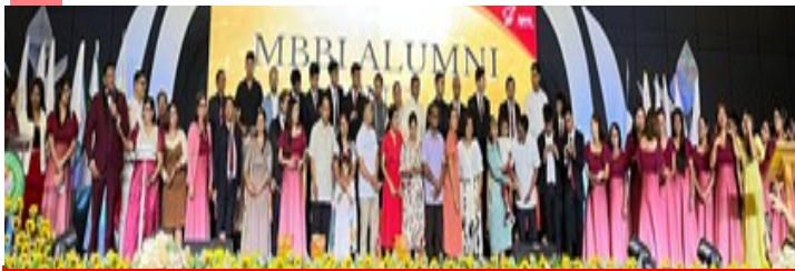
These are some of the graduates from the Bible school which my father started in 1990's. Many of them now are either pastoring local churches or teaching Sunday school regularly.