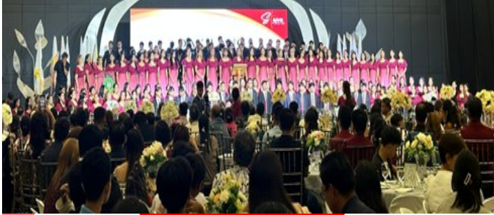
Choir sings "My Tribute"

On that day, 170-voice choir from different mission outreaches sang together and lifted up the name of Christ and ministered to all who came and even watched online. You may check us on Facebook @ Obbc Mandaluyong