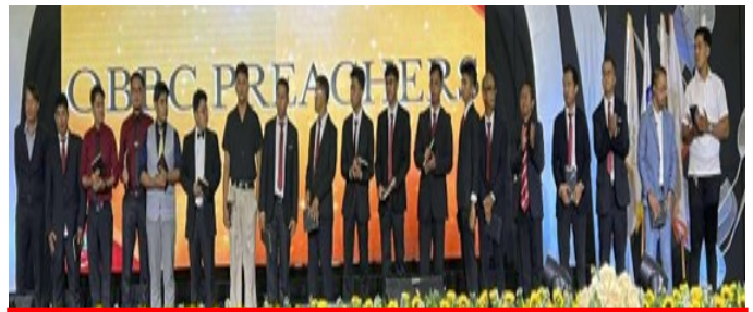
These are the preachers from diff. congregations that we train to assist their pastors in their local churches.