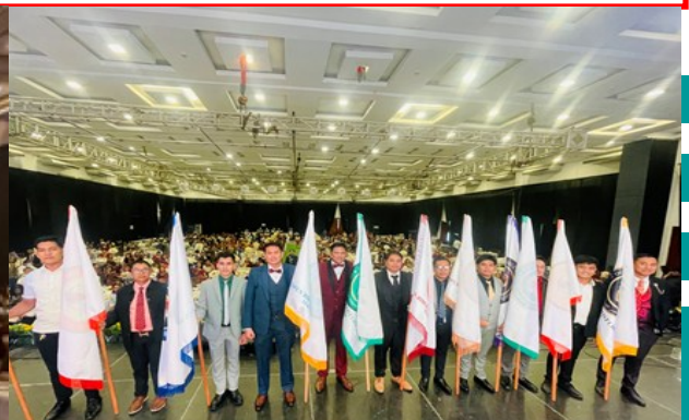
Each local pastor held a banner that represents the mission field they represent and that they lead. We desire to reach more souls, train more nationals and plant more churches in the years to come.