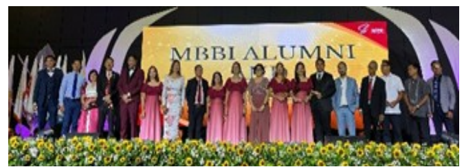
These are some of the faculties in our Bible Institute. Spiritual, practical, and academical learnings are imparted to students. God's Word is our final authority. "Enter to Learn, Go forth to serve"