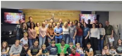
FBCJ Discipleship Conf.