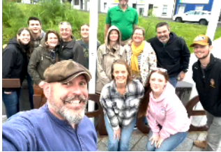
First Baptist of Ashland Team