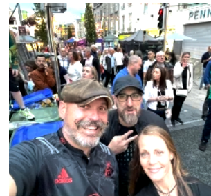
City Centre Outreach