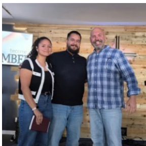
A new family joined TBf