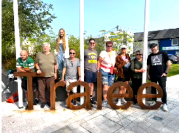
The Summit Church

How can I possibly capture all the incredible things God did in August in just one page? Honestly, it feels like a monumental task! But I'm committed to giving it my best shot. The truth is, you really need to come and experience it yourself. August was a thrilling month where we witnessed a year of preparation come to life, especially with the Summit Church joining us all the way from Ohio to make an impact during the