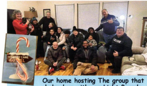
Our home hosting The group that helped us with our Light Parade Outreach