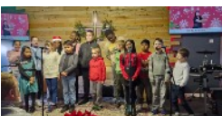
TBF Kids Club

So if that's not enough, there is something that, as parents, tends to stir my soul. I am proud of each of my kids, and it's always heartwarming to see them serve the Lord in one capacity or another. If you've been with us from the beginning, you know that our kids were outstanding missionaries. In December, we experienced a first for our family: